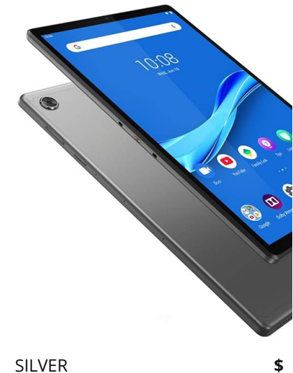
Lenovo Tab M10 or greater

WHITE Digital Premium Locking Floor Stand Kiosk