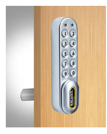
SILVER Electronic Smart Lock